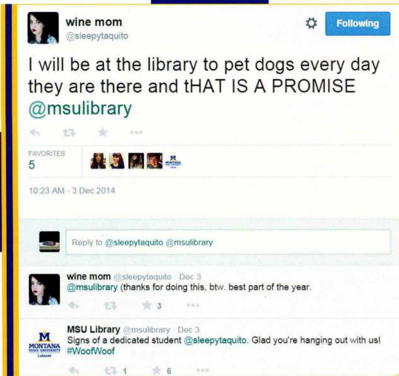
Interacting with undergraduate student around the event Paws to de-Stress event

Social Media Group ( lib.montana.edu/about/social-media ). This small committee—comprising three librarians and a library staff member—was tasked with providing direction, structure, and purpose for the library’s social media activity. This programmatic initiative allowed us to produce a focused outreach and community-building strategy for our library social media. To document our strategy and goals, we created a Social Media Guide ( lib.montana.edu/about/social-media/#guide ). We used it to direct our efforts and also to communicate our work to others within our organization and campus community. In short, creating and following our Social Media Guide allowed our social media to flourish. As one of our committee members is fond of saying, “Make a plan, work the plan.”