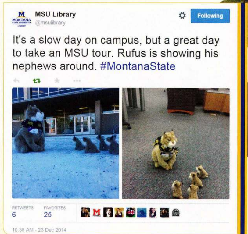
The Montana State University Library mascot, Rufus, in action

Once we had determined our central goal and supporting methods, we needed to form an advisory group to coordinate, strategize, and monitor our social media activities. In May 2012, we created the